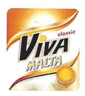
Class 32 that is to say: - Non-alcoholic malt drinks

Premium Beverages International B.V. of Tweede Weteringplantsoen 21, 1017 ZD Amsterdam, The Netherlands has applied through their agent Stowe & Co of 58 River Bank, P.O Box 1786, Roseau, Commonwealth of Dominica to the Companies and Intellectual Property Office for the registration of one Trade Mark consisting of the following word and device based on an application received on the 11th September 2018.