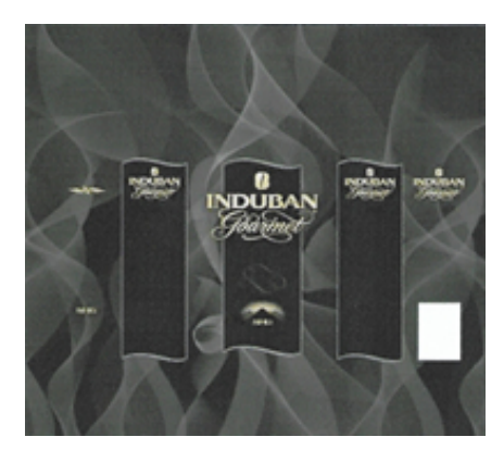
Class 30 that is to say: - Coffee

INDUSTRIAS BANILEJAS, SAS of AV. MÁXIMO GÓMEZ NO. 118, SANTO DOMINGO, REPÚBLICA DOMINICANA has applied through their agent de Freitas de Freitas and Johnson of Chambers, 14 Cork Street, Roseau, Commonwealth of Dominica to the Companies and Intellectual Property Office for the registration of one Trade Mark consisting of the following word and device based on an application received on the 20th February 2018.