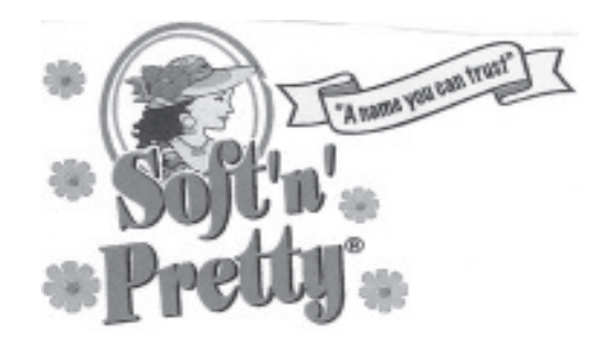
in Class 16, that is to say:- Toilet paper, towels of paper, table napkins of paper and face towels of paper.