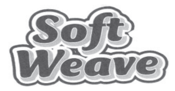
in Class 16, that is to say:- Toilet paper, towels of paper, table napkins of paper and face towels of paper.