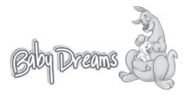
in Class 16, that is to say:- Toilet paper, towels of paper, table napkins of paper and face towels of paper.