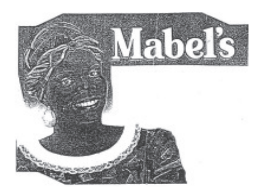
THE MARK shown above, Registration No. 155/1996 has been renewed in the name NATIONAL CANNERS LIMITED, CHURCHILL ROOSEVELT HIGHWAY, ARIMA, TRINIDAD, West Indies of as of the 5<sup>th</sup> day of December, 2010 in respect of goods in International Class 30 consisting of:, Coffee, tea, cocoa, sugar, rice, tapioca, sago artificial coffee; all included in

Class 30. The mark will remain valid for a period of ten years until the 5<sup>th</sup> day of December, 2020 upon which it can be renewed for further periods of ten years.