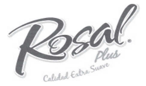
in Class 16 that is to say:- Toilet paper, towels of paper, table napkins of paper and face towels of paper

GRAND BAY ST. LUCIA LIMITED OF POINTE SERAPHINE, P.O. BOX 195, CASTRIES, ST. LUCIA, has applied through their agent ALICK C. LAWRENCE CHAMBERS OF NANCY WHITICKER HOUSE, 7 OLD STREET, ROSEAU, COMMONWEALTH OF DOMINICA, to the Companies and Intellectual Property Office for the registration of one trade mark consisting of the following word and device based on an application received on 15<sup>th</sup> day of April, 2011.